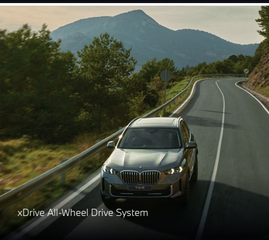
xDrive All-Wheel Drive System