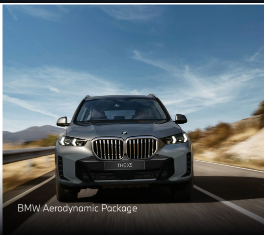
BMW Aerodynamic Package