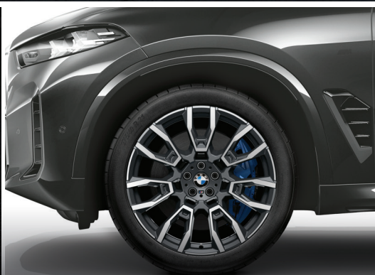
21" M light alloy wheels V-spoke style 915 M Bicolour with mixed tyres and runflat tyres with M Sport Brakes