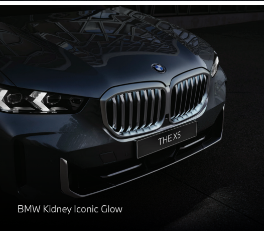
BMW Kidney Iconic Glow

Car specifications may vary from the model shown. Options and features available are model-dependent.