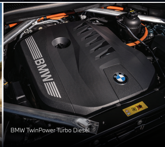
BMW TwinPower Turbo Diesel